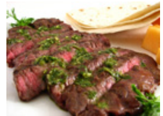
Photo 4 looks yummy! It's also from a public album on Flickr, one on how to prepare flank steak. The photo was taken and posted by a local chef, and is listed for commercial use under Creative Commons. One thing this particular Creative Commons license allows us to do is alter or change the image.

Right for the ad campaign? Why or why not? _____